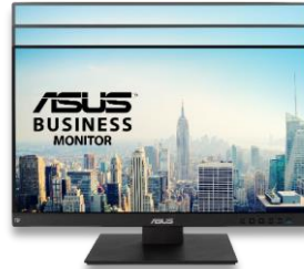
Height Adjustment (0 to 130mm)