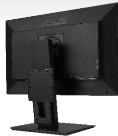
With mini PC mounting kit (option)