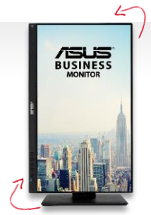
Pivot(+90° to -90°)