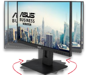
Swivel(+180° to -180°)